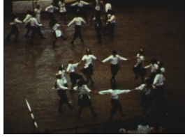
Voice of La Raza (1971)