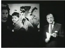
Dallas at the Crossroads (1961)